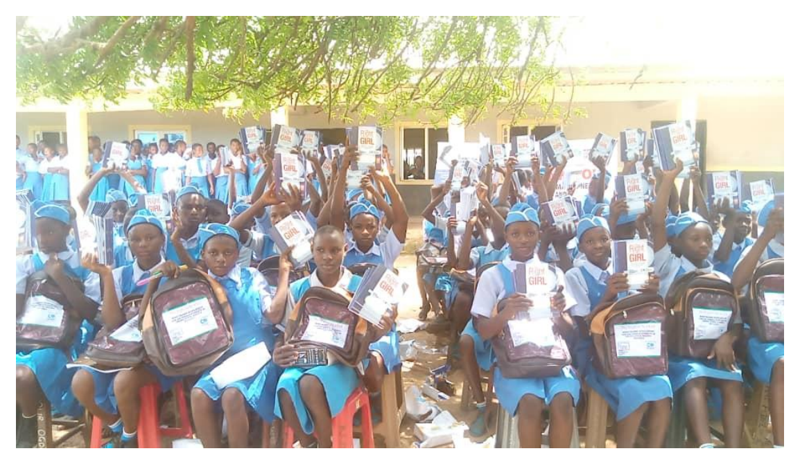
...inspired to uplift women, youths and PWDs for a fruitful life in the society