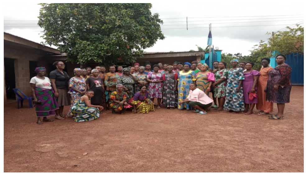
Ugwuaji Community women peer learning groups