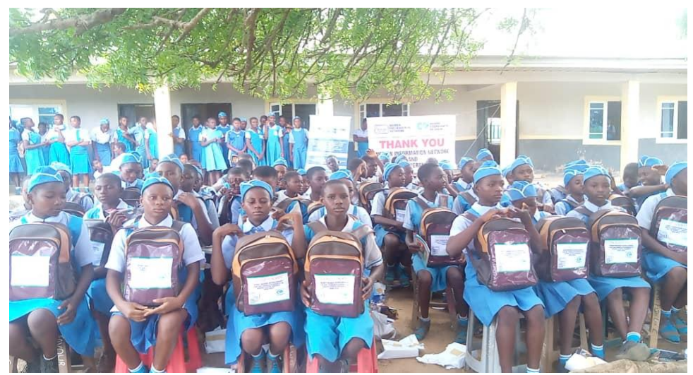
60 benefitting female students of Girls Secondary School Oduma, Aninri Local Government Area, Enugu State at the award ceremony on 18<sup>th</sup> May 2023

graciously re-newed the scholarship for the one hundred and twenty-eight beneficiaries in Comprehensive Secondary School Akpasha and Community Secondary School, Iva –Valley.