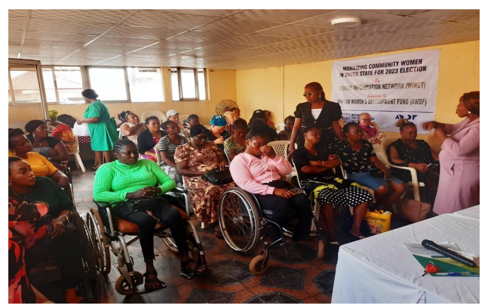
Women with Disabilities during mobilization for voting in 2023 General Elections in Enugu State on 31st January 2023

In preparation for voting in the 2023 general elections in Enugu State, WINET educated women of Ugwuaji and Amagu Akegbe-Ugwu communities as well as Women with Disabilities on the importance of participating in elections as voters.