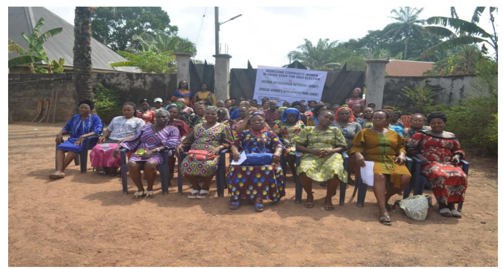
Amagu Akegbe-Ugwu Women at a forum to prepare them to vote in Nigeria's 2023 General election on 2<sup>nd</sup> February 2023