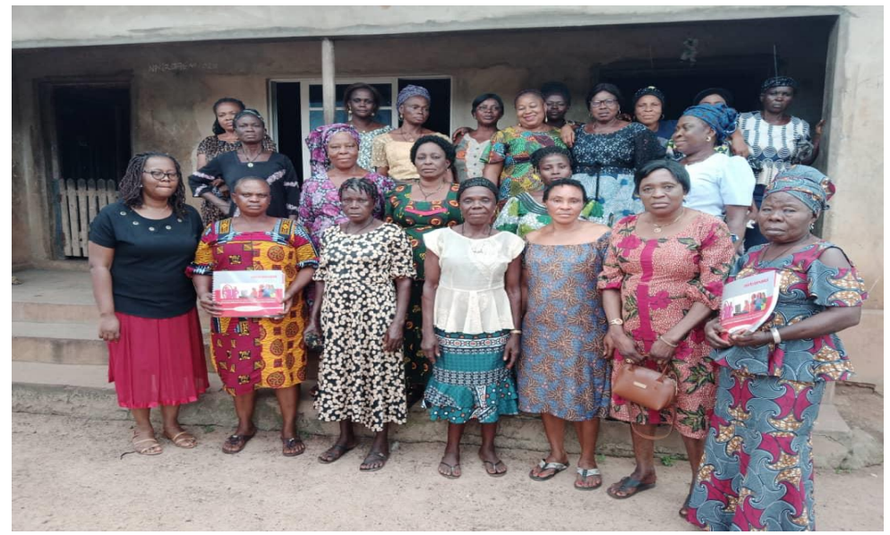
Amagu Akegbe-Ugwu Community peer educators