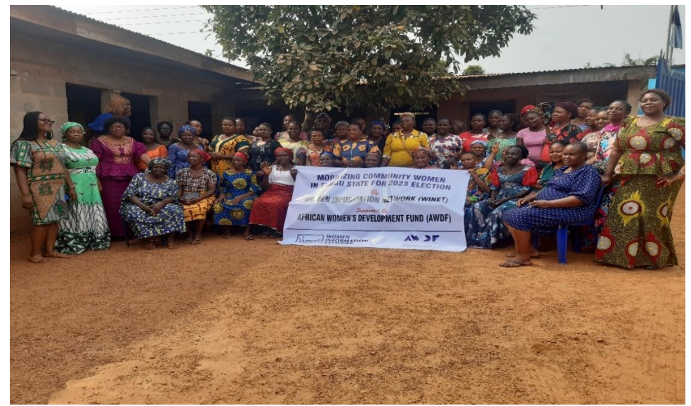
Women of Ugwuaji Community during mobilization to prepare them for voting in the 2023 General Election in Nigeria on 23<sup>rd</sup> January