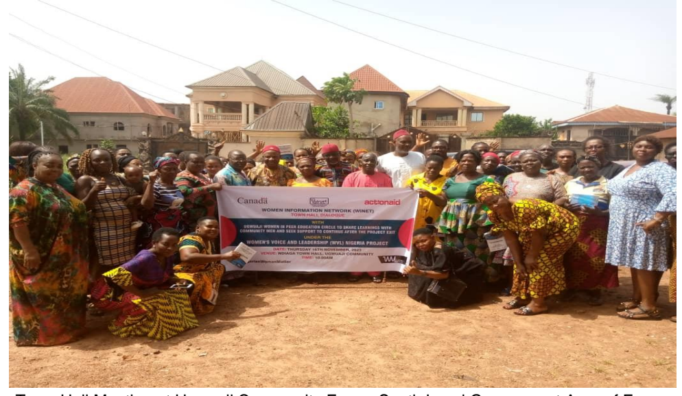
Town Hall Meeting at Ugwuaji Community Enugu South Local Government Area of Enugu State on 16<sup>th</sup> November 2023