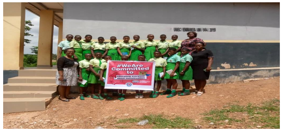
2023 World Menstrual Hygiene Day celebration @ Community Secondary School Iva- Valley, Enugu on 28th May 2023

This day offered an opportunity for WINET to empower some female students on how to manage their menstruation safely, hygienically and with confidence.