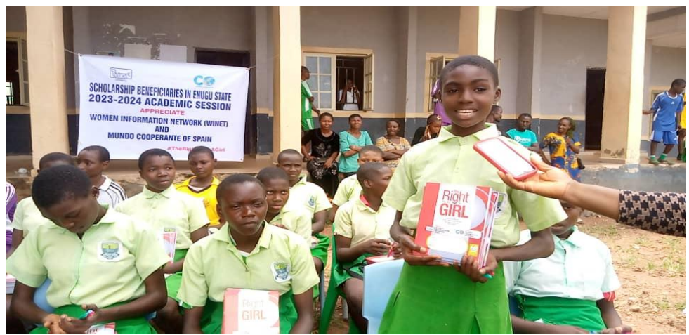
A student appreciates WINET & Mundo Cooperante of Spain for the scholarship and supply of books