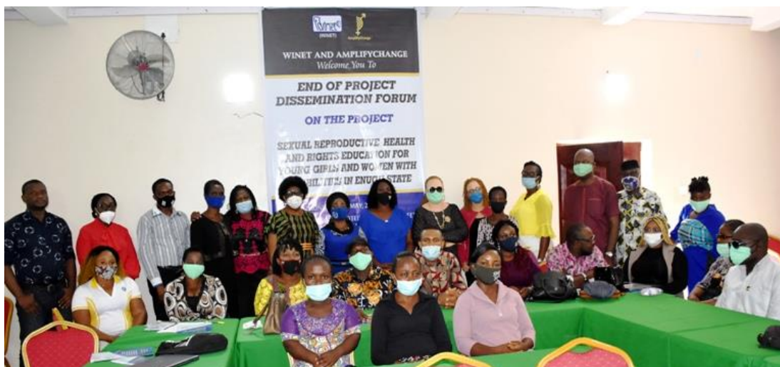
Group photograph of participants during the presentation of findings from the end line survey in Enugu.