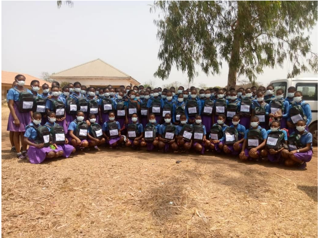
106 beneficiary female students from Community Secondary School, Ndeaboh, Ani Nri local government area, Enugu State.