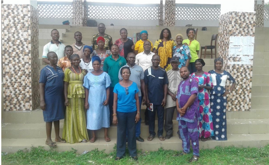
Group photograph at MSP formation at Aninri LGA on 11 th May, 2021

Under the project, smallholder farmers were inaugurated into Multi-Stakeholders Platform (MSP) by CSOs for local government level, while the selection of state level MSP for four (4) Local Government Areas comprising Isi-Uzo, Nkanu-West, Aninri and Udeni, was carried out.