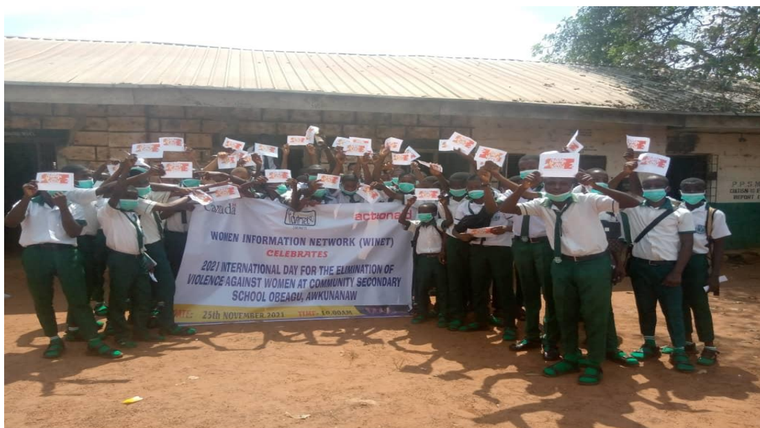
Group photo of participants during 2021 International Day for the Elimination of Violence Against women at Community Secondary School Obeagu on 25 th Nov. 2021

Beneficiaries of the project were 90 female members of Enugu State Chapter of Joint National Association of Persons with Disabilities (JONAPWD), comprising Enugu State Association of the Deaf, Enugu State Association of the Blind, Enugu State Association of Physically Challenged Persons, The Little People and Albino Foundation.