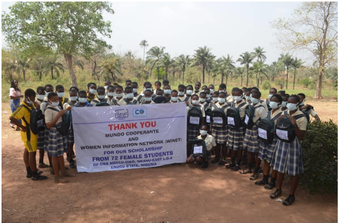
72 female student beneficiaries from Comprehensive Secondary School, Mbulu-Owo, Nkanu-East local government area of Enugu State.