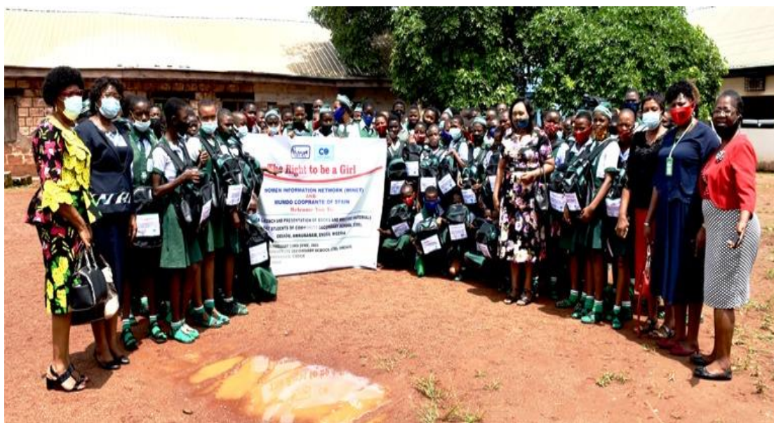
147 female beneficiaries of Community Secondary School, Obeagu, Awkunanaw, Enugu South Local Government area with WINET team, Principal and teachers