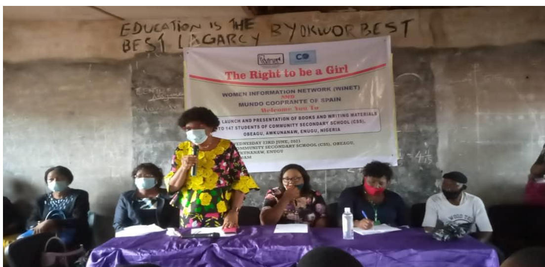
The Executive Director of WINET addressing the 147 students during scholarship award ceremony at Community Secondary School Obeagu, Awkunanaw in Enugu South local Government Area, Enugu State.