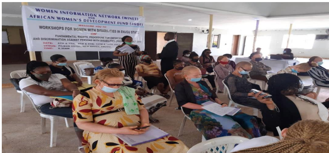
Cross session of members of Association of the Blind and Albino Foundation during the workshop in Enugu