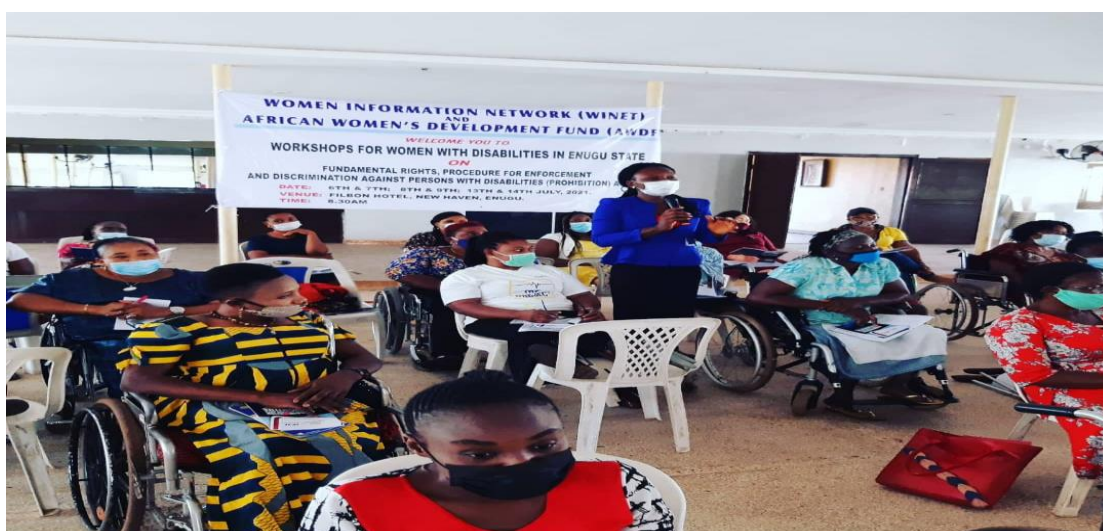
Cross session of female members of Association of the Physically Challenged, Little Person and Spinal Cord Injuries Association during the workshop.