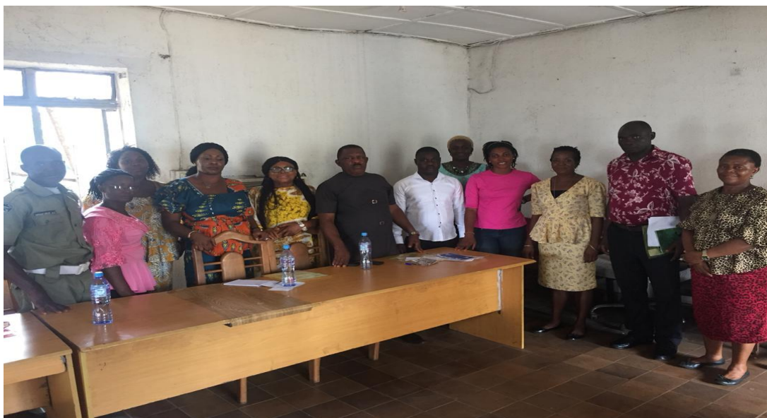
CSOs and participants during social inclusion meeting on 20 th May, 2021

In May, 2021 Enugu CSOs project team organized a meeting for inter-ministerial intervention to promote inclusion of women, PWDs and youths. The social inclusion meeting gears to promote the involvement of women, youths and PWDs in the oil palm production, as it will serve as a means of earning income and promotion of productivity of oil palm in the community and the society.