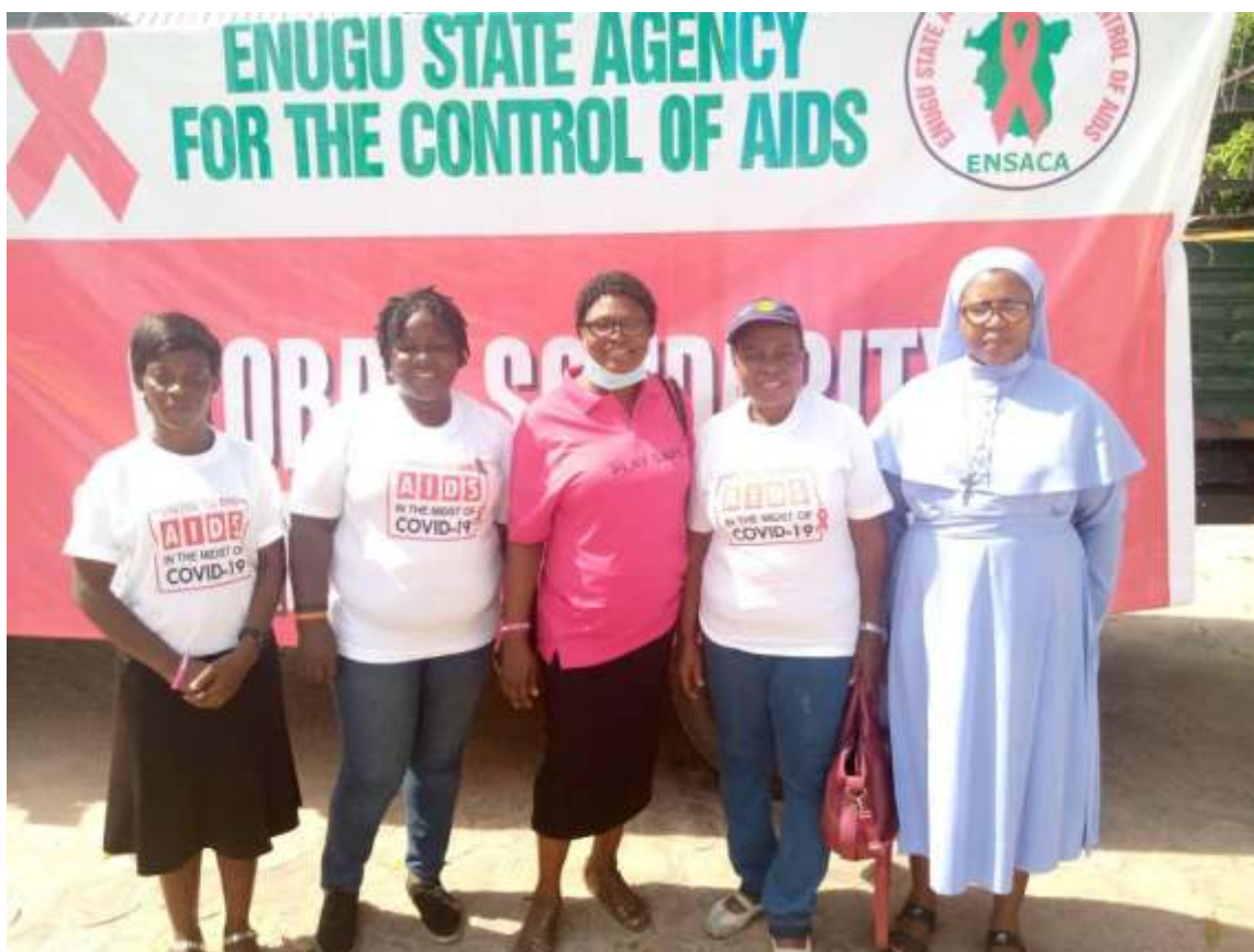
2020 World AIDS Day celebration in Enugu