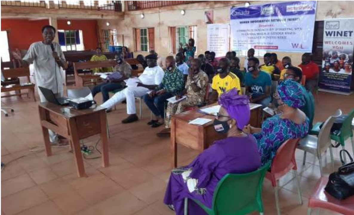
At Umuchigbo Iji-Nike