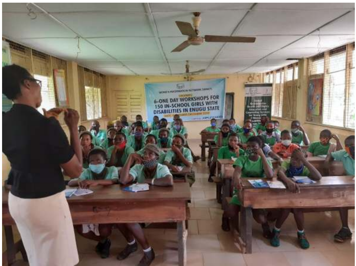
A Sign Language Interpreter during SRHR training for deaf students at Special Education Centre, Oji River on 5 th November 2020