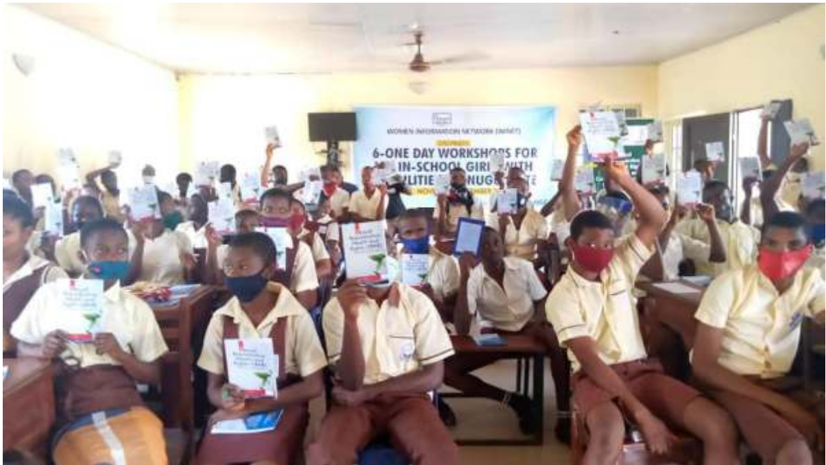
Students displaying their training manuals during one of the workshops in Special Education Centre, Ogbete Enugu on 3 rd November 2020