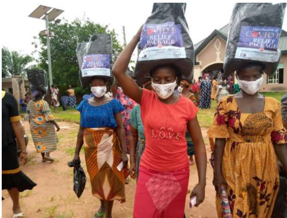
Women of Ebenebe community going home with their palliatives