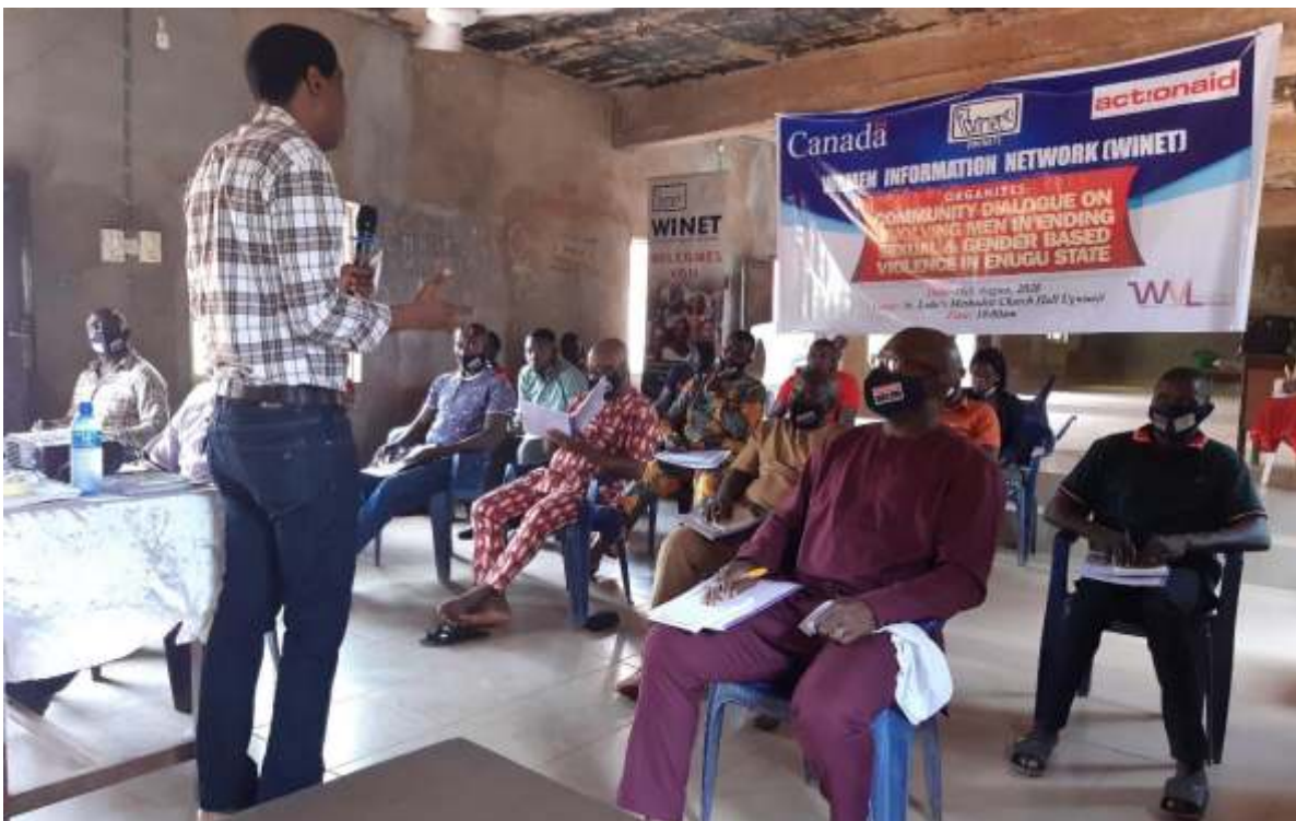
At Ugwuaji, Enugu South Local Government