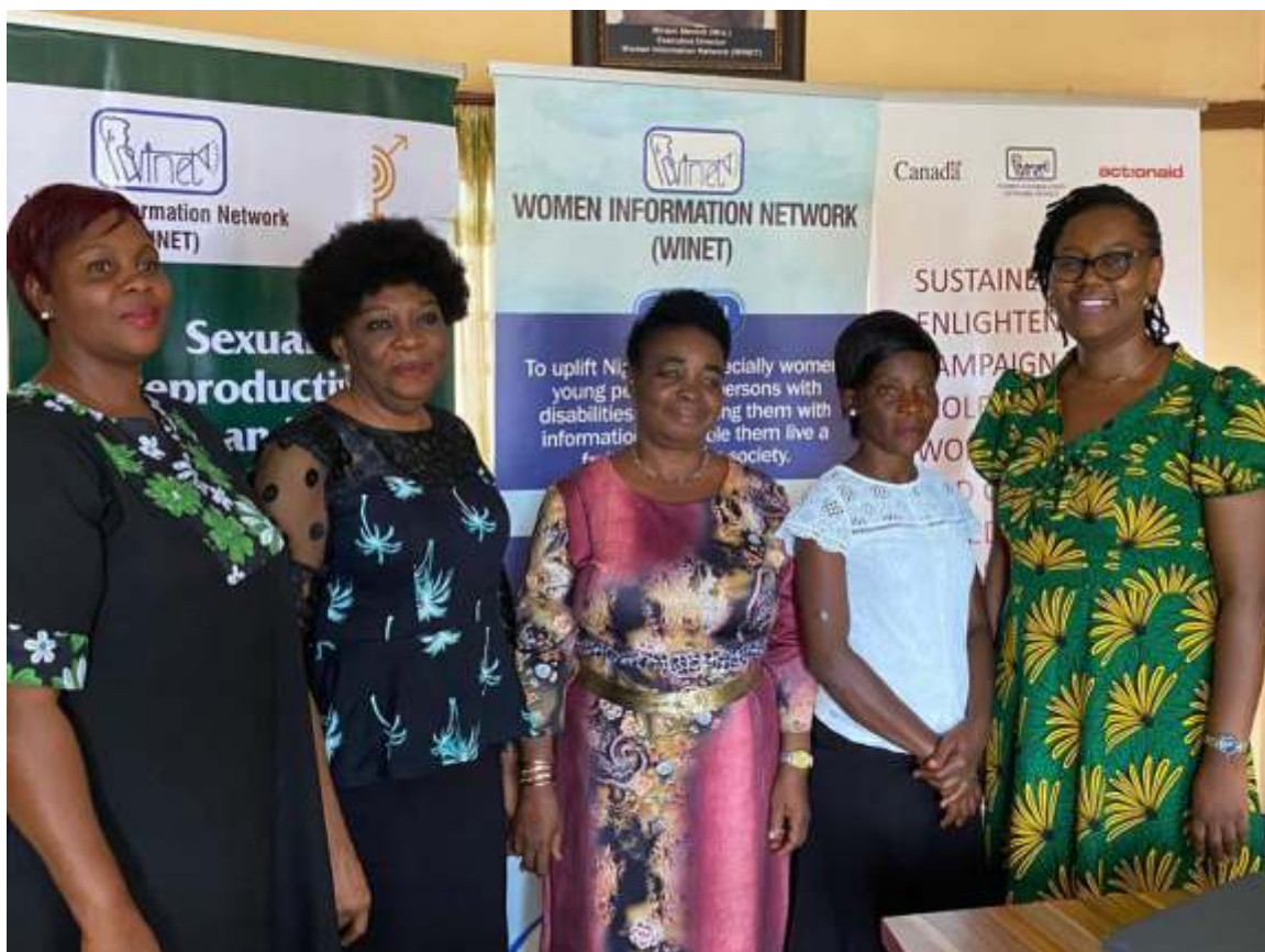
The WINET Team