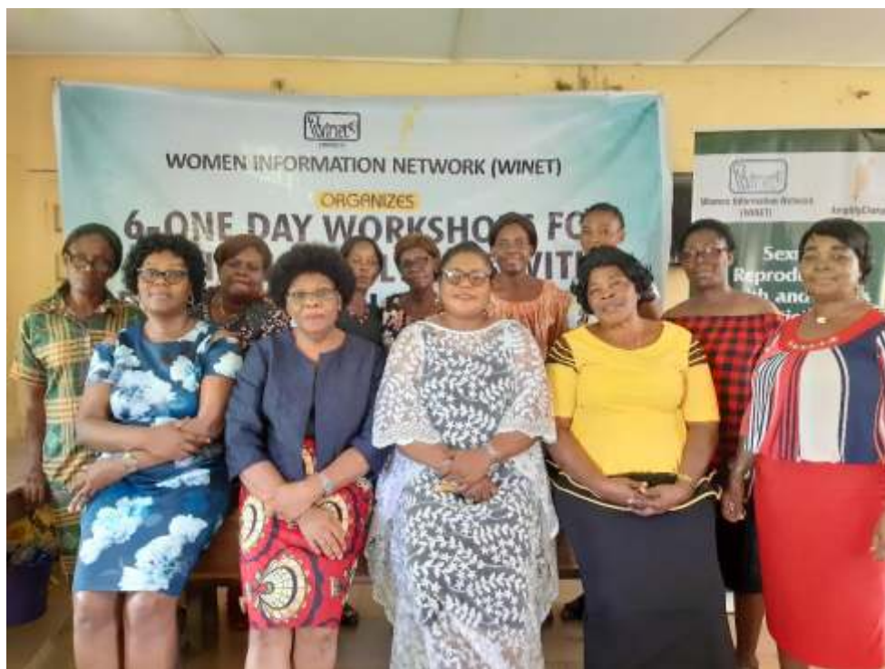
Sign Language Teachers at Special Education Centre Oji River with Principal and WINET Team during a SRHR workshop for students