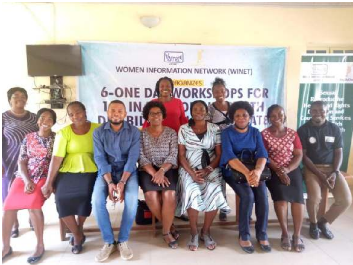
Sign Language Teachers at Special Education Centre Ogbete Enugu with Principal and WINET team during a SRHR workshop for students